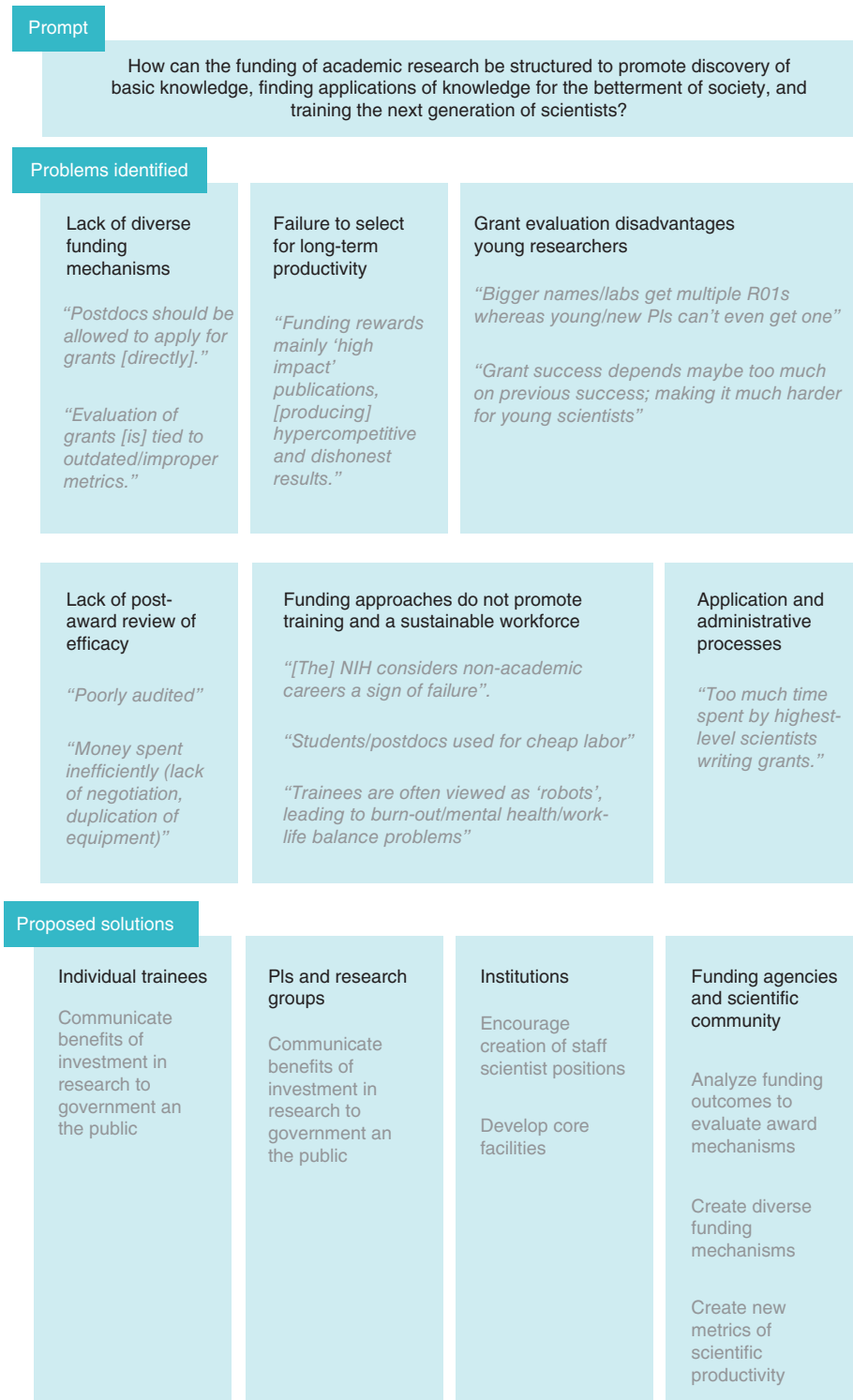
Chart 3. Summary of the outcomes of the funding workshop. Overall, we would characterize the output of this workshop as a call by young researchers for an increase in the efficiency and reproducibility of science by developing new measures of the quality

of research output and of individual researchers' productivity, and incorporating these criteria into the approval of grants. Participants seemed to agree that this approach, along with some of the other recommendations indicated, would more adequately reflect